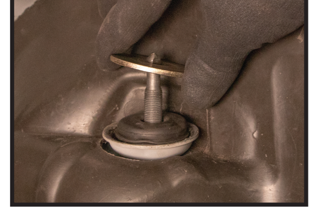
FIGURE 13 FIGURE 14

4. REINSTALL THE PROVIDED TOP NUT ONTO THE DAMPER AND TIGHTEN TO MANUFACTURER'S SPECIFICATIONS. (FIGURE 15)