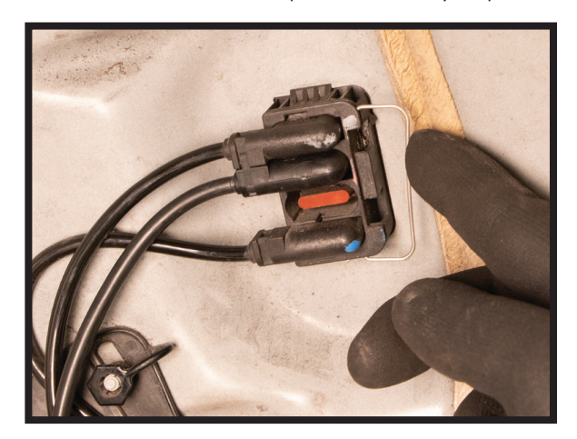
FIGURE 22 FIGURE 23

10. FASTEN THE ELECTRICAL WIRES INTO PLACE ALONG THE WIRING GUIDE. (FIGURE 24)